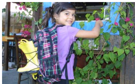
Almost 5-year old modeling the Grom in Pink Plaid.