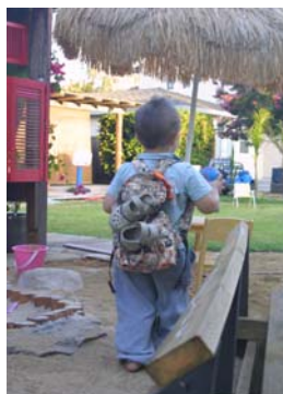
2 1/2-year old modeling the Go Go in Gallery.