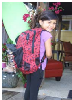
Almost 5-year old modeling the Scooler in Red Ninja.